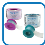
Sil-Flex™ Silicone Tape