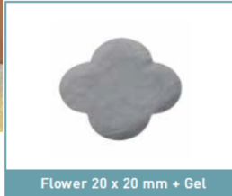
Flower 20 x 20 mm + Gel